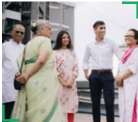
Rishi Sunak and Akshata Murty visit Akshaya Patra