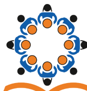
प्रधानमंत्री पोषण शक्ति निर्माण Pradhan mantri Poshan Shakti Nirman (PM POSHAN)

MINISTRY OF EDUCATION GOVERNMENT OF INDIA