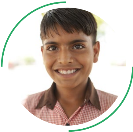
Madhav Upper Primary School, Kamai, Nandgaun, Mathura, Uttar Pradesh

"I want to be a software engineer and develop apps."