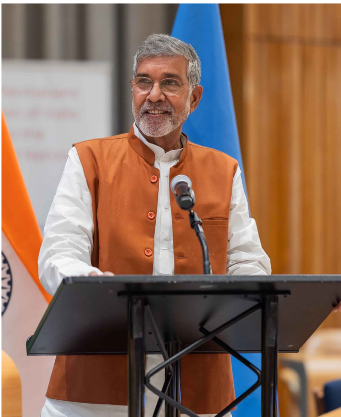
Kailash Satyarthi Noble Laureate and UN SDG Advocate