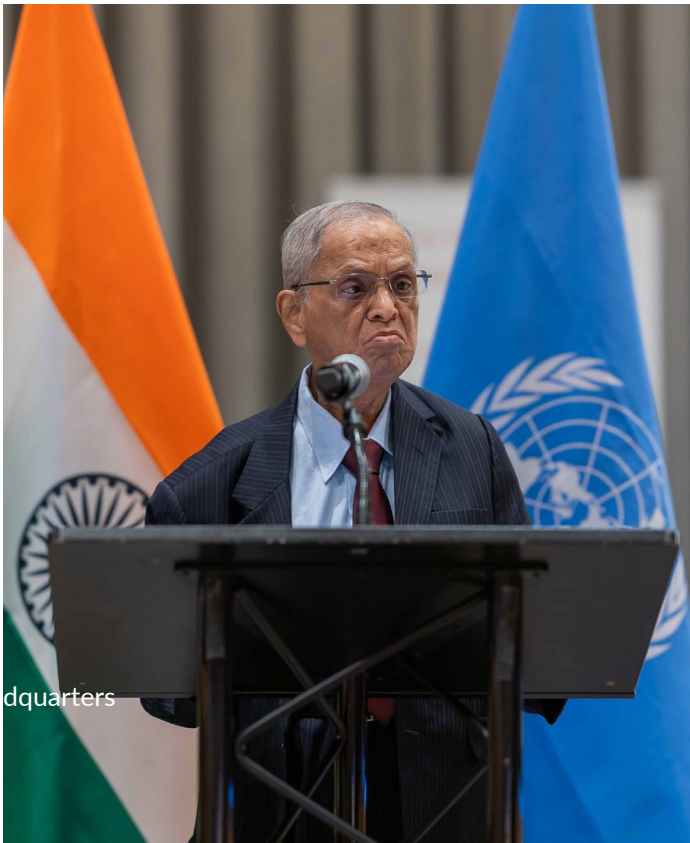
N R Narayana Murthy Chairman Emeritus, Infosys