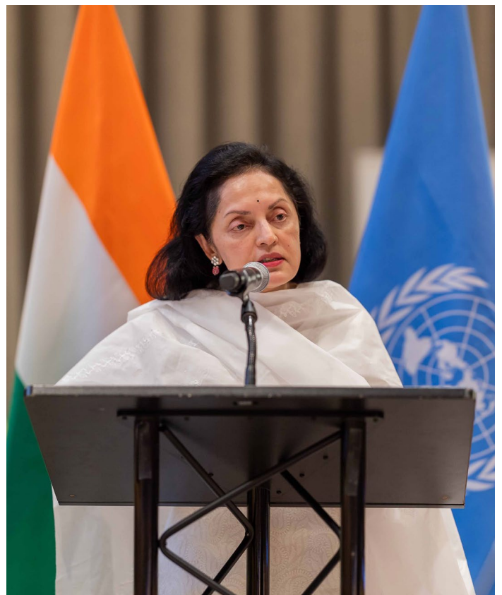
Ruchira Kamboj Permanent Representative of India to the United Nations