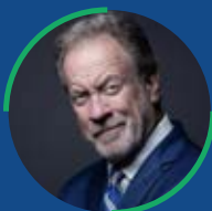
David Beasley, Executive Director, UN World Food Programme (WFP)

If you want to change the future of a nation, well, it starts with your children and India is now the world's largest provider of school meals - over 110 million meals for children every single day. Good nutrition means children stay in school, children get healthier, children learn better and that means India's economy and future is getting brighter by the day.